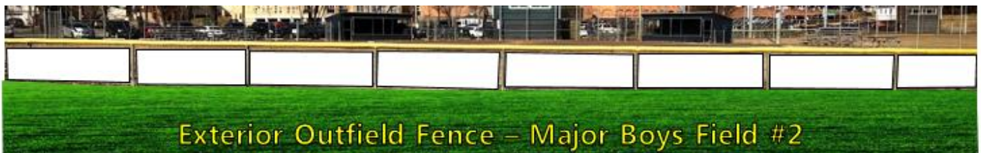
Exterior Outfield Fence – Major Boys Field #2

Elkton Little League – ElktonLL21921@gmail.com