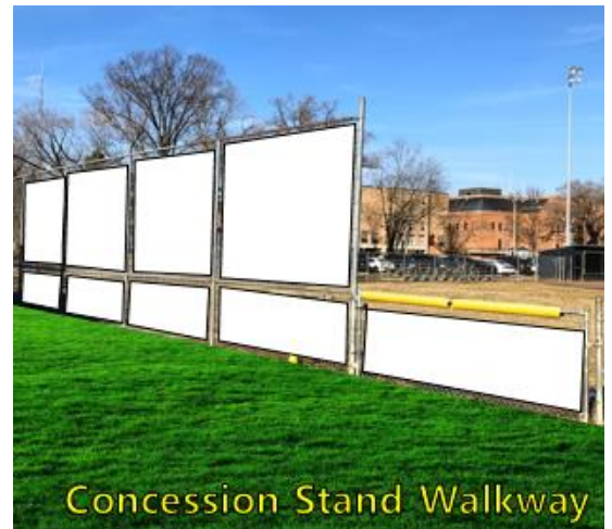
Concession Stand Walkway

Through a wide variety of sponsorships and customized advertising programs, the executive board is ready to work with you and your business to maximize the exposure that is available for your company and its business objectives. Join us in a combined effort to support a community pastime for our children and reach the vast audience that is ready to receive your company's message.